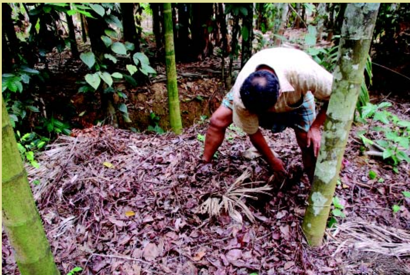
Leaf fall from trees serve as mulch