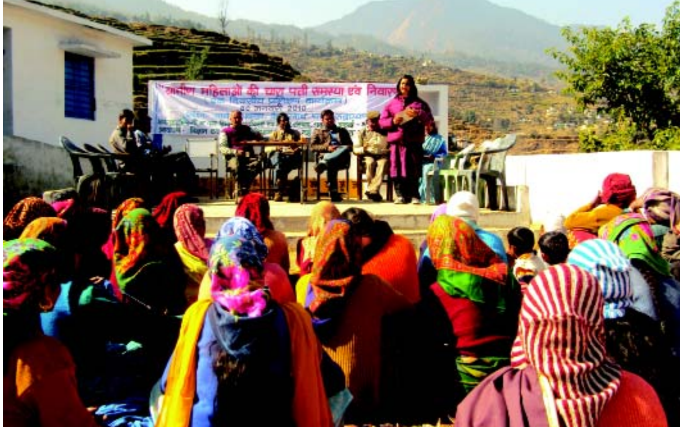
Women come together to discuss fodder problem and explore solutions