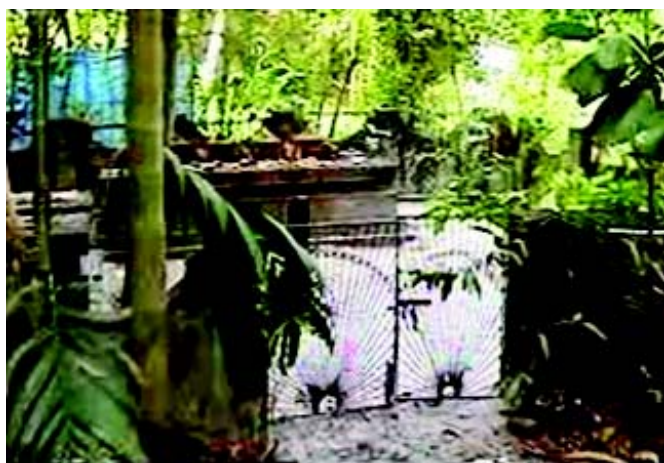
Sacred groves are a repository of tree biodiversity

sericulture, apiculture, aquaculture, floriculture, nursery units etc making way for the home gardens to be categorized as subsistence with subsidiary commercial interest. Such type of specialization aided the home garden with continuous production throughout the year helping in better income generation and also family labour involvement.