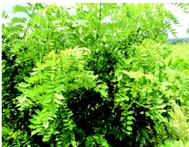
Trees on farms for yielding additional biomass