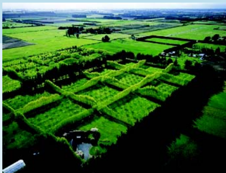
Trees on field bunds in New Zealand